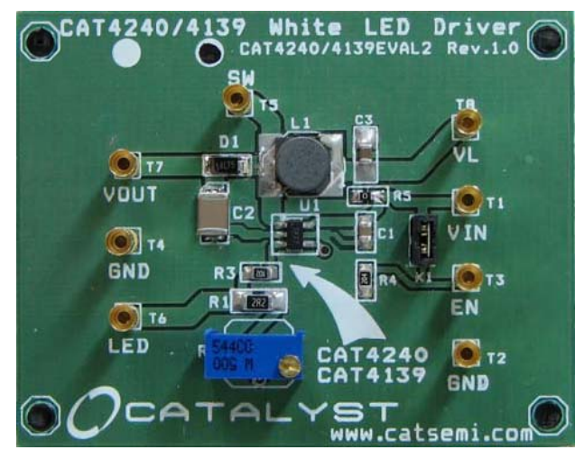
Figure 2. CAT4139AEVB Board